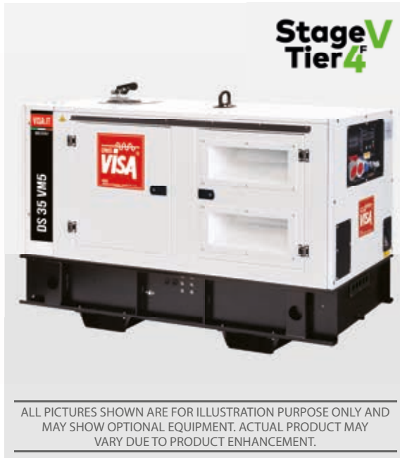
ALL PICTURES SHOWN ARE FOR ILLUSTRATION PURPOSE ONLY AND MAY SHOW OPTIONAL EQUIPMENT. ACTUAL PRODUCT MAY VARY DUE TO PRODUCT ENHANCEMENT.